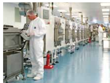
Our fully validated production facility provides a unique product quality