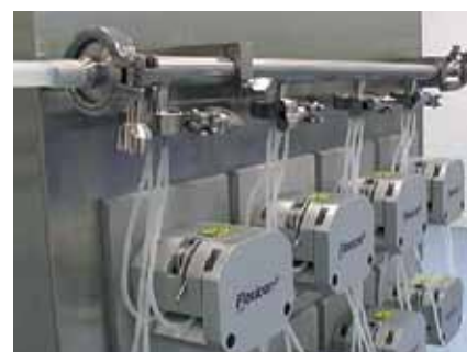
Easy set-up on high capacity filling lines provides a fast changeover and reduces product waste