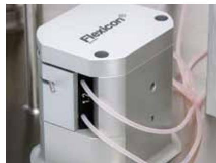
Mechanical properties of ACCUSIL™ are adapted for use on PD12 and PF6 peristaltic pump heads