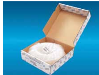
Packed for protection against contamination and UV light

Our engineers can help you choose the perfect filling equipment for ACCUSIL™ tubing.