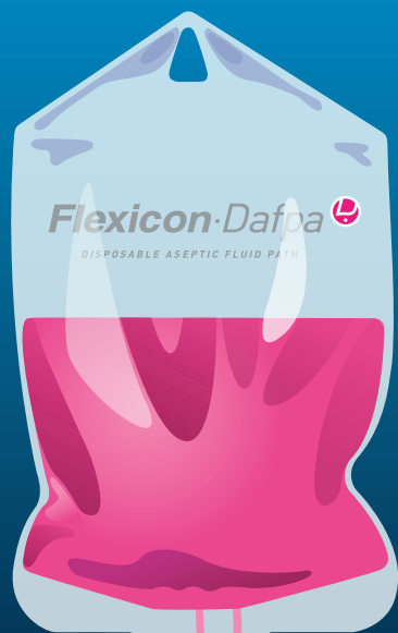
Disposable Product Bag